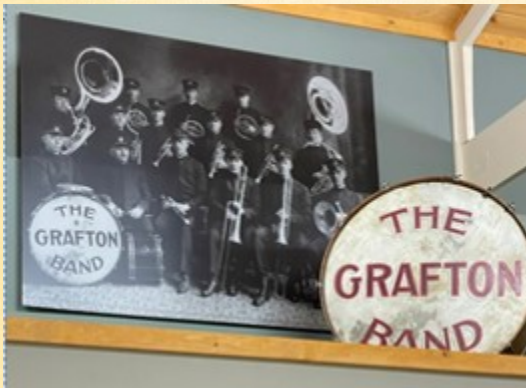
Photo: Grafton Band in early 1900's along with the original Grafton Band Drum sits on top of ledge in Village Hall..